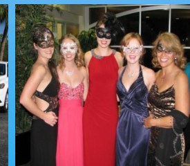
Dining in the Dark